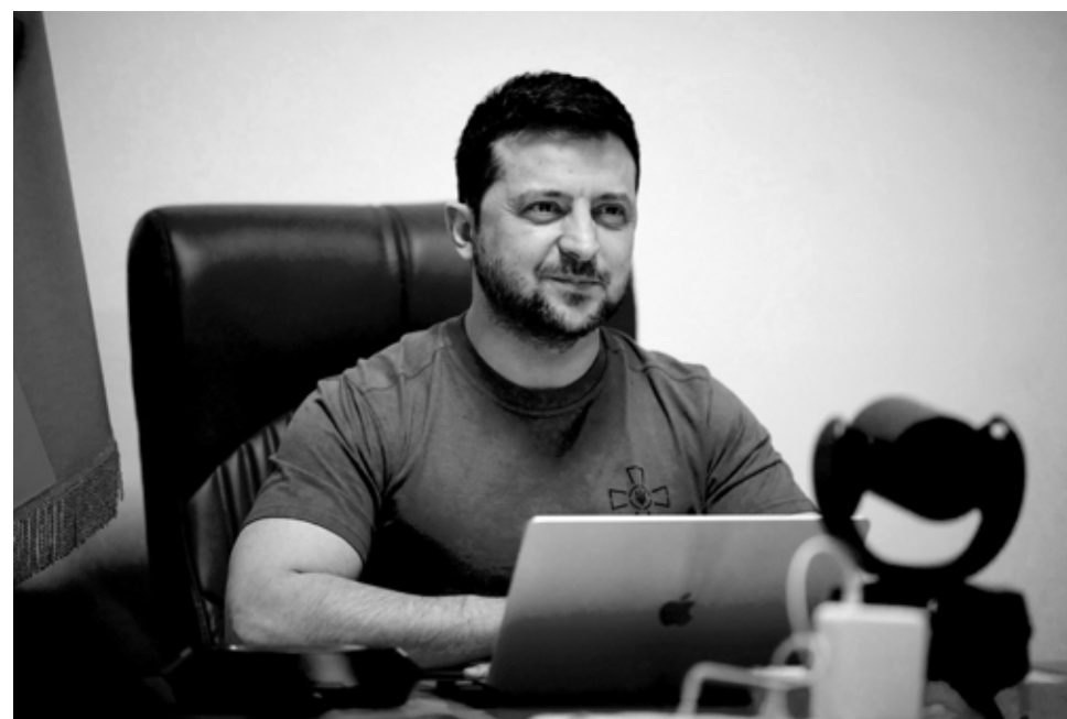
Ukrainian President Volodymyr Zelensky delivering video address to U.S. Congress March 16.

But of course, that's the whole idea. Propaganda only works on those who