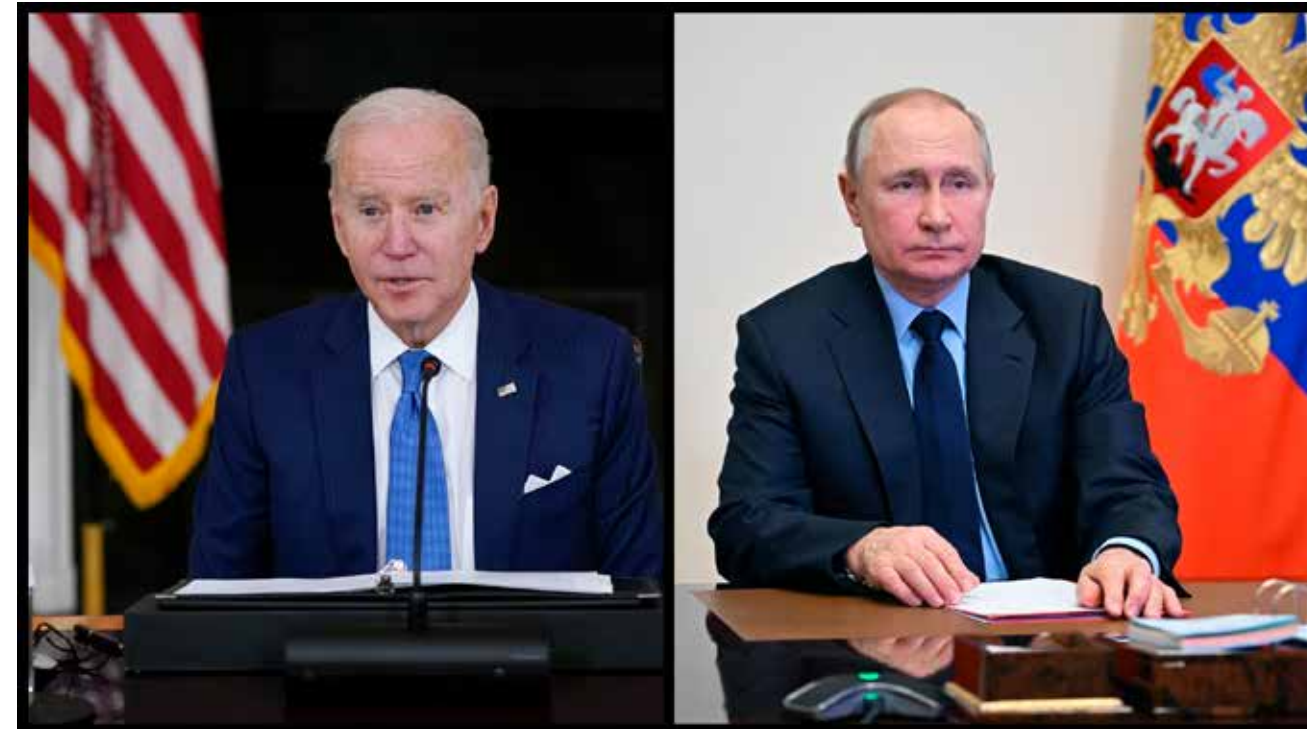
Biden declines to 'walk back' comment on Putin not remaining in power.

The "events in Ukraine" that "reinforced" the Kremlin's perception included not just the 2014 coup but the proxy war that erupted in the eastern Donbas region as a result. Unwilling to live under a U.S.-backed far-right government that banned the Russian language, venerated Nazis, and committed atrocities like the Odessa massacre, rebels in Donetsk and Luhansk took up arms in the spring of 2014 with Russia's support. The Ukrainian government responded with an "Anti-Terrorist Op-