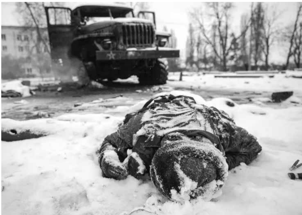
The body of a Russian soldier is coated in snow next to a destroyed Russian military multiple rocket launcher vehicle on the outskirts of Kharkiv, Feb. 25.

Only the autocrats and politicians who dream of empire and global hegemony, of the god-like power that comes with wielding armies, warplanes, and fleets, along with the merchants of death, whose