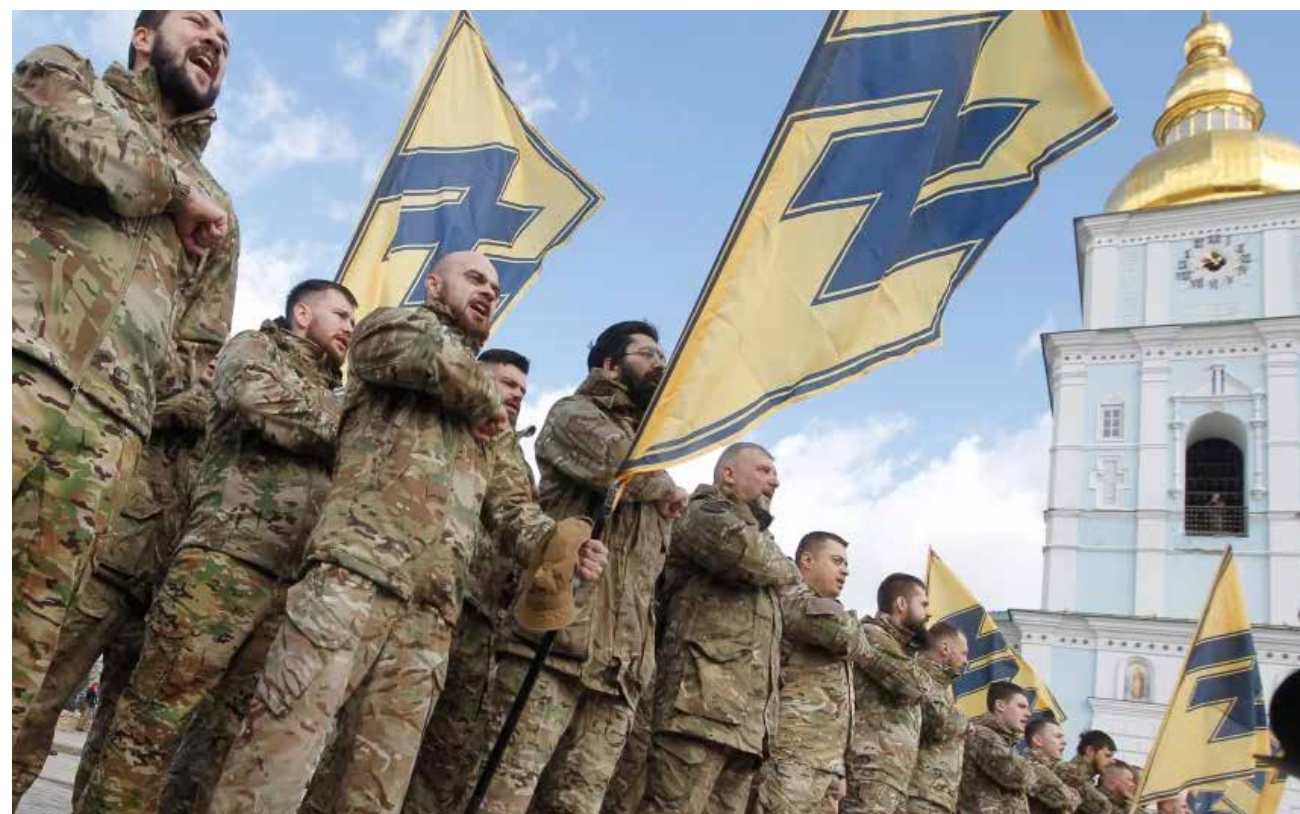
Members of the Azov Battalion

"We are with you, your fight is our fight and we will win together," McCain told Ukrainian state media. "In 2017 we will defeat the invaders and send them back where they came from."