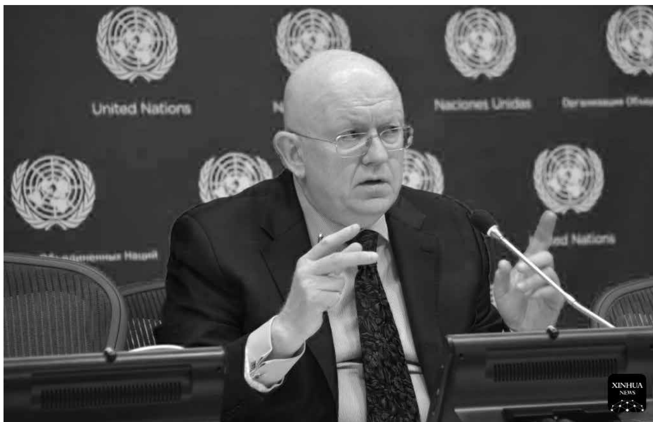
Vasily Alekseevich Nebenzya, Russian Ambassador to the United Nations.

The U.S. and NATO went one step too far for the Russian Federation with the February 2014 overthrow of the elected, but allegedly corrupt, Russia-leaning government of Ukraine, an overthrow that was encouraged and supported by the U.S. government. Fascist militias joined with ordinary Ukrainian citizens who did not like the corruption in their government. But rather than waiting less than one year for the next elections, riots began and hundreds were killed in Maidan Square in Kyiv by snipers from both the government and the militias.