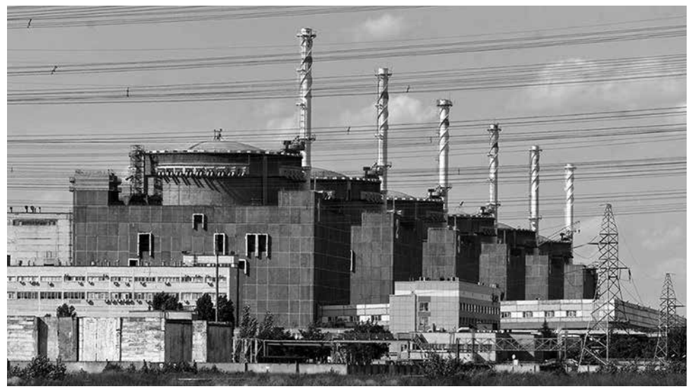
Zaporizhzhia Nuclear Power Plant, the largest in Ukraine.

The nonstop barrage of information, misinformation, disinformation and rallying around the flag has presented the peace movement with a dilemma. How do peace-loving people righteously condemn the Russian invasion—the destruction of cities, the killing of hundreds of civilians, the displacement of millions? How do we