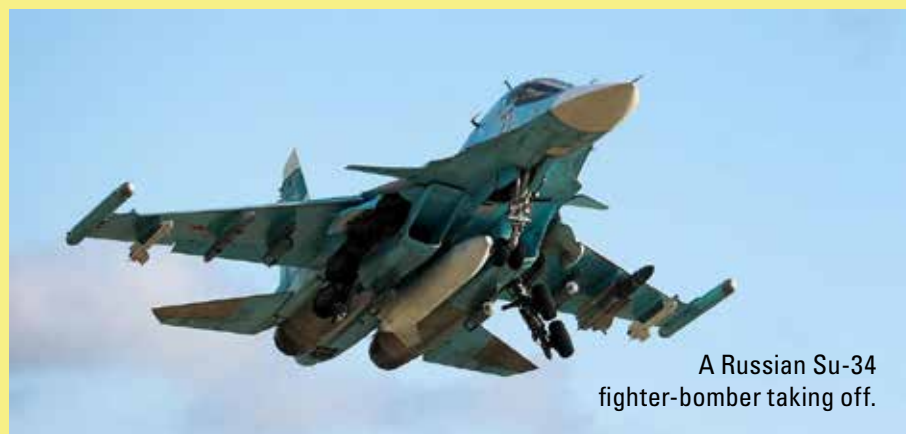
A Russian Su-34 fighter-bomber taking off.

Veterans For Peace continues to urge President Biden and congressional leaders to not implement a no-fly zone and to use every available diplomatic resource to push for an immediate ceasefire and withdrawal and to apply pressure on other nations to do the same.