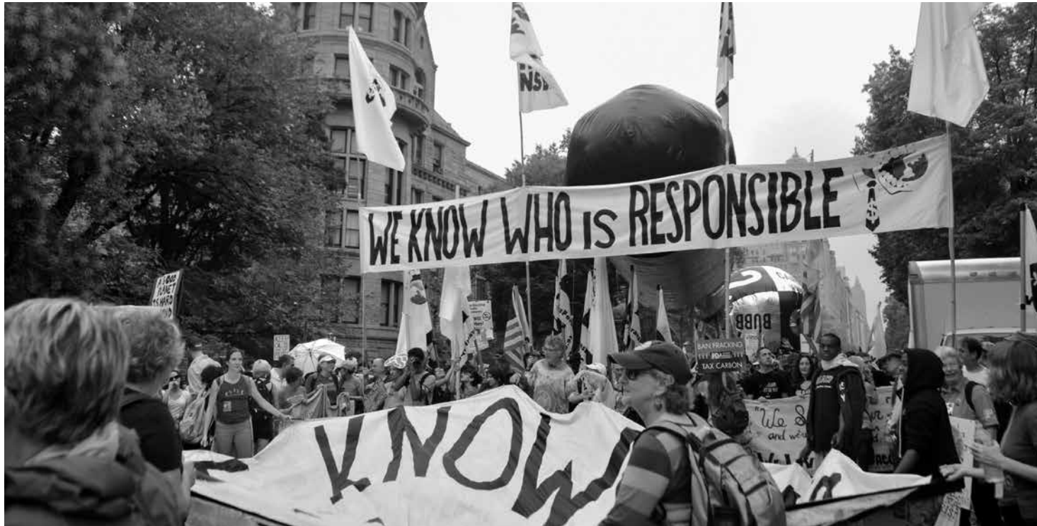
People’s Climate March, Sept. 21, 2014.

With the rise of green capitalism (as much an oxymoron as green war), the misconception that we can save the planet by buying a tote bag or two has risen in parallel.