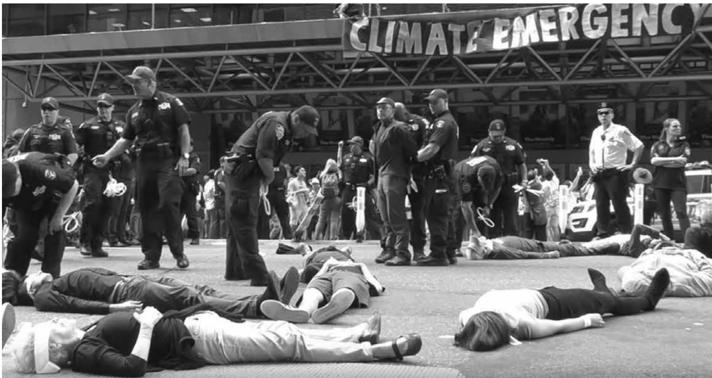
Seventy activists arrested at New York Times protest June 22.