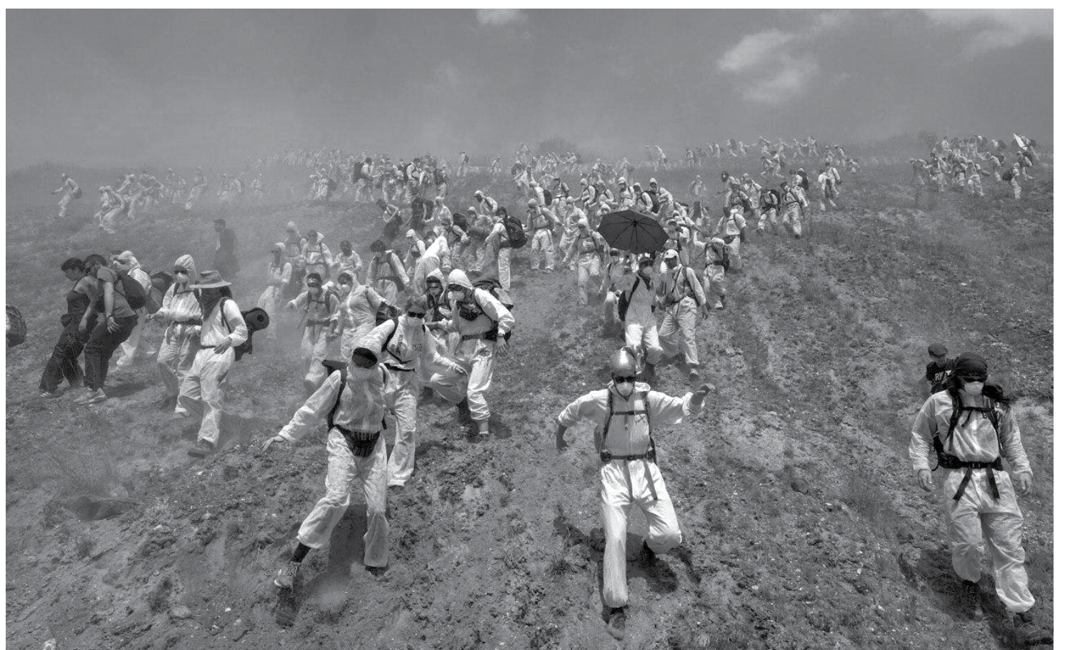
Climate activists storm the Garzweiler mine in Germany.

A P U B L I C A T I O N O F V E T E R A N S F O R P E A C E