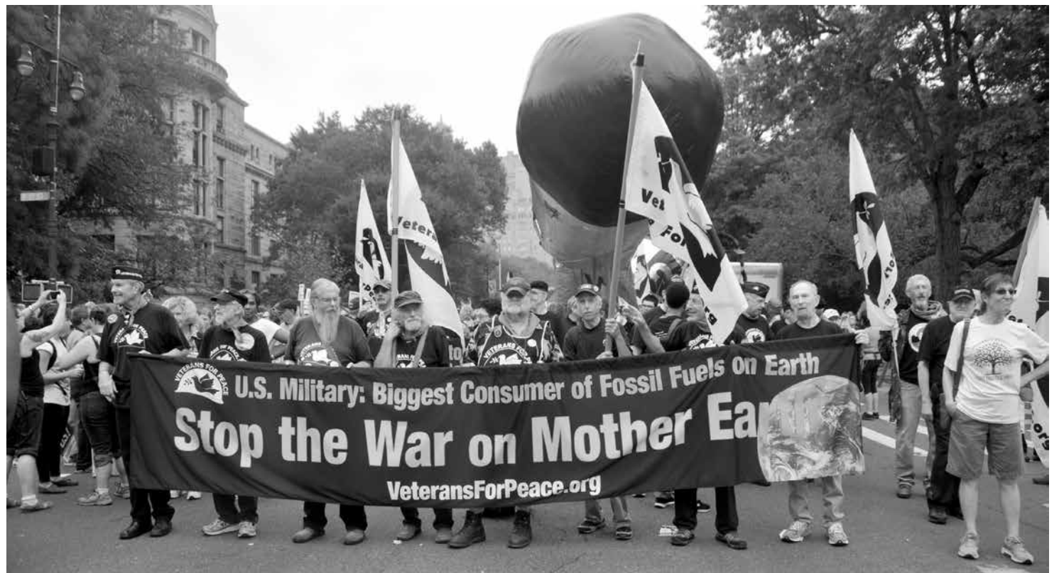
Veterans For Peace at the People's Climate March, Sept. 21, 2014.

It is reminiscent of Senator Elizabeth Warren's tweet in mid-May, which lamented that "climate change is real, it's worsening by the day, and it's undermining our military readiness. More and more, accomplishing the mission depends on our ability to continue operations in