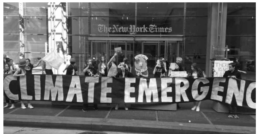
Outside the New York Times offices June 22.

Hundreds of people descended on the headquarters of the New York Times on Saturday, June 22, to demand that the “paper of record” drastically improve its coverage of the global climate crisis and specifically that its reporters refer to the situation as a “climate emergency” in alignment with what the world’s scientific community is warning.